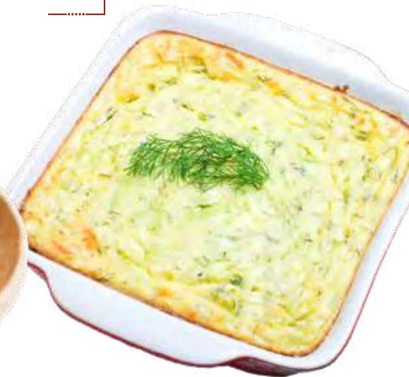
Egg Bake Casserole $2.25/serving