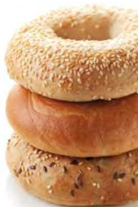
Bagels & Muffins $1.75/serving