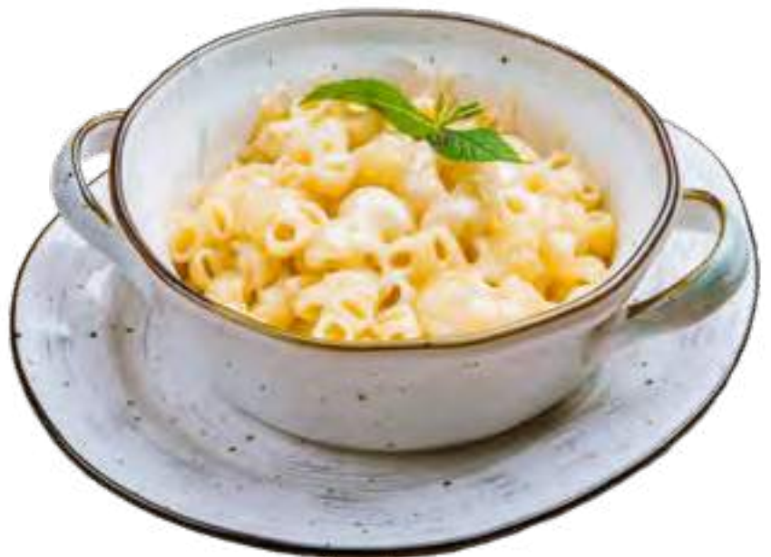
Mac-N-Cheese Appetizer Buffet

Choose any 7 appetizers for $14.99 per guest