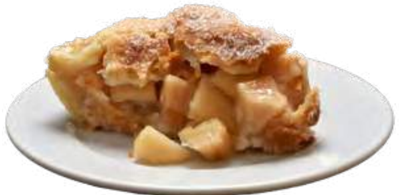
Apple or Pumpkin Pie $1.75/serving