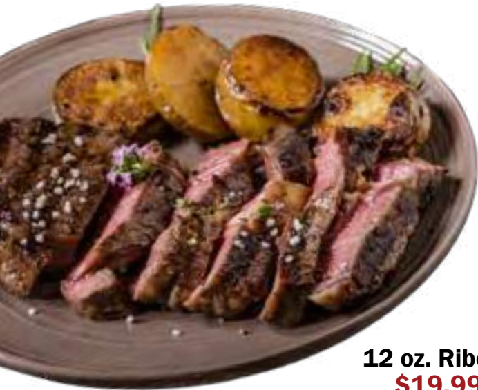
12 oz. Ribeye $19.99

Includes choice of two sides, roll and butter or Texas toast or bread sticks. Table service included. Get single hot entrée for 1/2 of meal price. Add $2.00 for an additional entrée. All prices are subject to change due to market fluctuations.