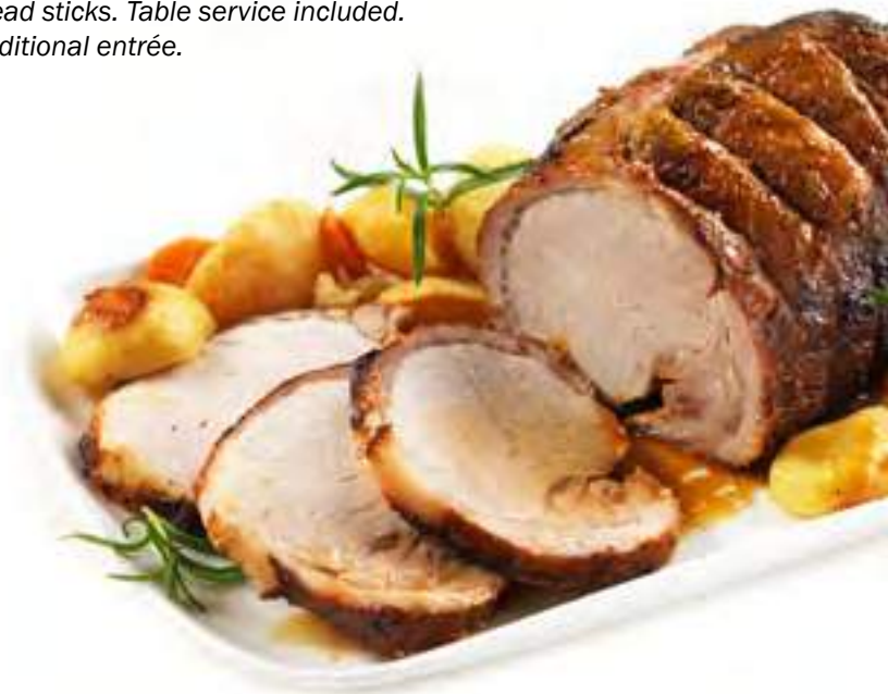
Roast Pork Loin $12.49