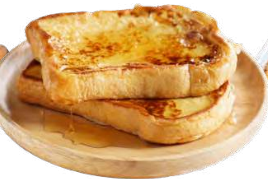
French Toast & Syrup $1.50/serving