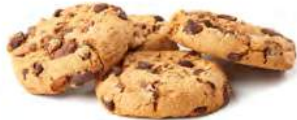
Assorted Cookies $1.15/2 cookies